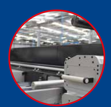
Optional rail mounting system to allow flexibility of machine configuration