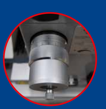
Kocher & Beck Gapmaster anvil adjust