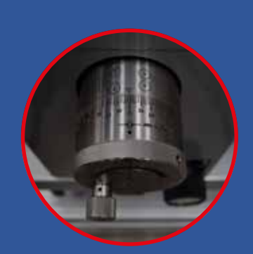
Rotometrics ACA anvil adjust