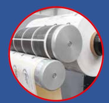
Contact matrix stripping option for high speed stripping of difficult label shapes