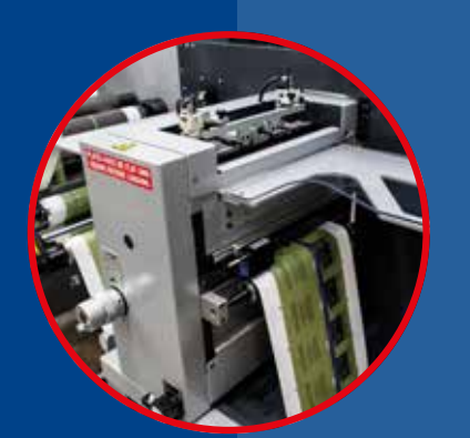
Automatic Die Plate Mounting/Removal System Flexible dies are mounted accurately and precisely with high resolution cameras.

die cutting system running at 150 metres per minute with repeats of 100-558mm. International Patent Application PCT/GB2016/000102.