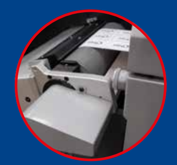
Chill roller option