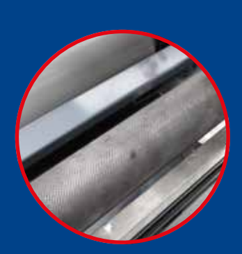
Low inertia carbon fibre rollers