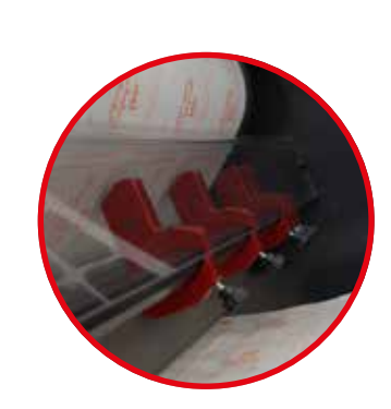
Scissor, Razor and Crush slitting modules with 5 holders