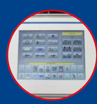
Easy to operate HMI control panel