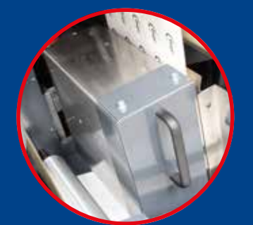
Hot air dryer option for aqueous varnishes and coatings