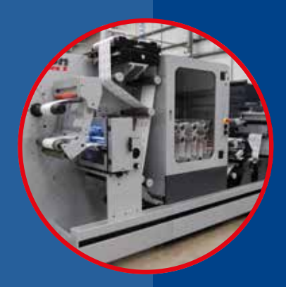
Semi-Automatic Turret Rewinder

Achieve significant time saving when setting knives with the NEW label gap sensor.