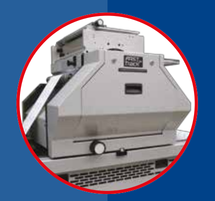
FAST Track die The world's fastest semi rotary die cutting system

die cutting system running at 150 metres per minute with repeats of 100-558mm. International Patent Application PCT/GB2016/000102.