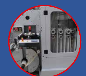
Inline/offline operation with buffer option